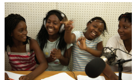
Schoolchildren in Maganja da Costa prepare and record a program for local radio as part of a Child-to-Child activity promoted by UNICEF.