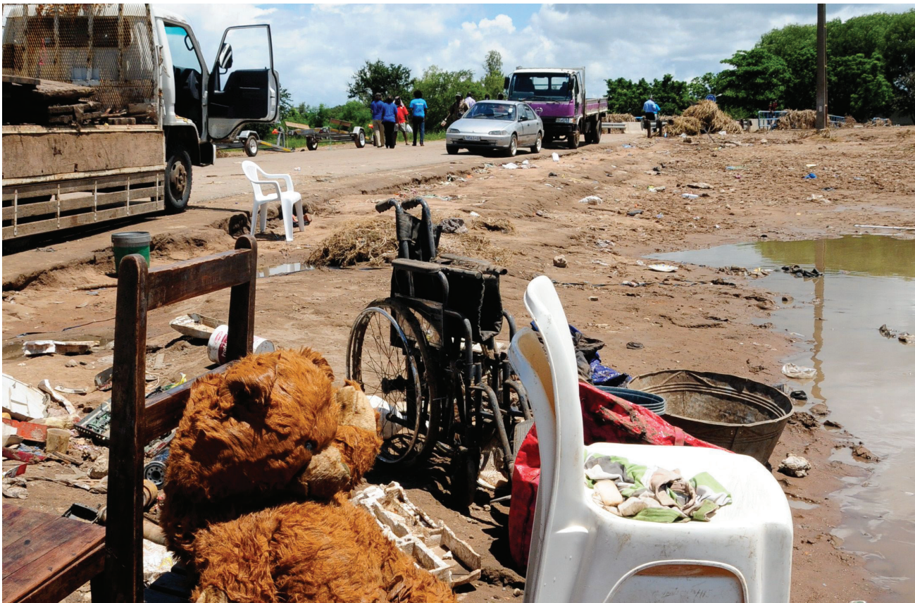
Chokwe in Gaza Province was devastated by the flooding of the Limpopo River. Here some possessions remain in the mud after most of the town's inhabitants were relocated.