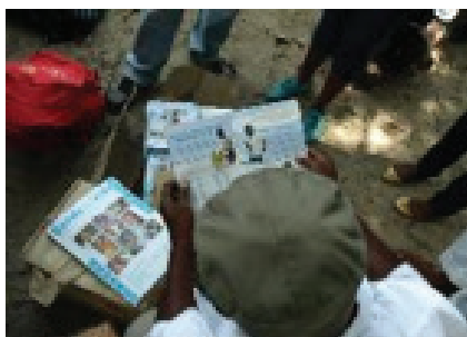
A health promotion coordinator in Chiquelane accommodation center reviews IEC materials on HIV and malaria prevention, nutrition and hygiene promotion.