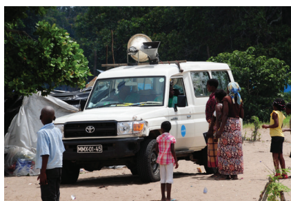
Health promoters use mobile units equipped with megaphones to promote essential health and hygiene messages to flood-affected communities.

recreational activities in a safe environment. UNICEF distributed Family Kits 7 to vulnerable households (including HIV-affected households), torches to women and girls and recreational kits to children. 8