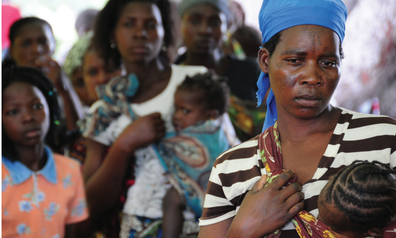
At the Chiaquelane Medical Tent, the wait for medical attention is long in the heat. Most are here for diarrhoea, respiratory infections, or malaria.

services was high, resulting in overcrowding. Interagency assessments attempted to estimate facility burden before and after the floods, but calculating these estimates proved challenging.