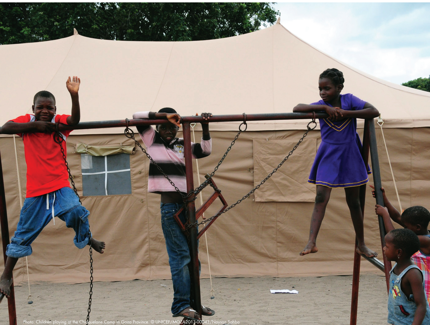
Photo: Children playing at the Chiquelane Camp in Gaza Province.

2013 FLOODS IN GAZA PROVINCE, MOZAMBIQUE