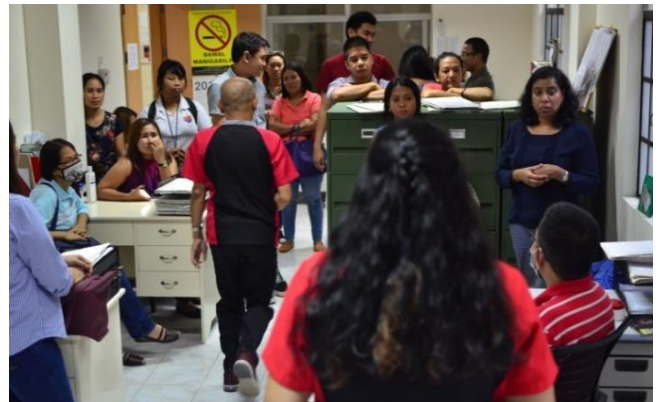
Iloilo City social workers visit the Western Visayas Medical Center - HIV/AIDS Core Team during the city tour of their Service Delivery Network.

It is also recommended that the rest of the Western Visayas region should learn from the experience of Iloilo City and other Local Government Units should consider replicating this project. This can be done through a Regional Development Council Resolution enjoining all Local Government Units to replicate the best practices of the Iloilo City pilot project on proxy consent and case management of adolescents living with HIV. It is envisaged that the same regional partners on the Iloilo City pilot project will be involved in scaling up the project throughout the region. Other regions may also learn from the experiences of the Ilonggos, and the approach can be tailored to the contextual dynamics of other communities. Those wishing to replicate the project should identify HIV champions and advocates. Partnerships must be institutionalized to ensure adolescents receive the rightful care that they deserve.