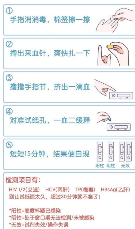
User guide for male