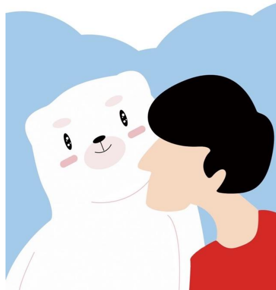
Male version package