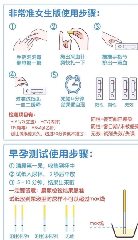
User guide for female