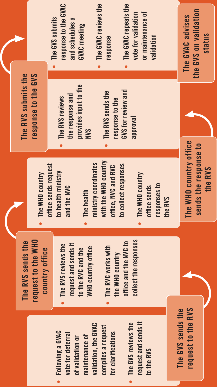
Figure 7 Process for deferring validation and maintenance of validation and collecting clarifying information