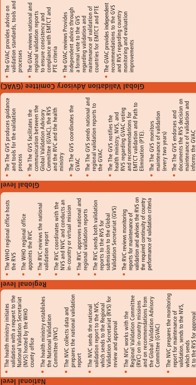
Figure 4 Governance and coordination of the process of validation and maintenance of validation for EMTCT of HIV and syphilis and PTE