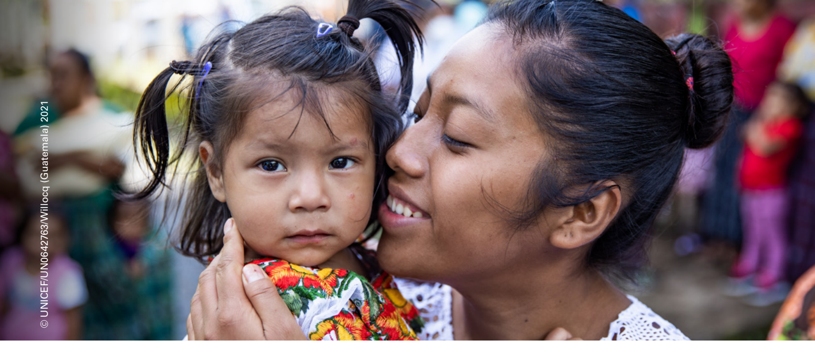
A young mother and her daughter from the Chacalte Chichen Mayan community, participate in a UNICEF-supported parenting workshop in Chirrepec, Alta Verapaz.